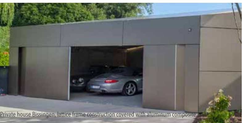
Private house Bissingen, lattice frame construction covered with aluminum composite