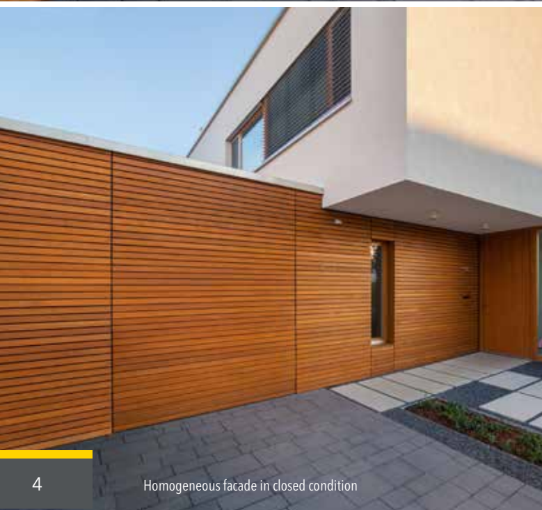
Homogeneous facade in closed condition