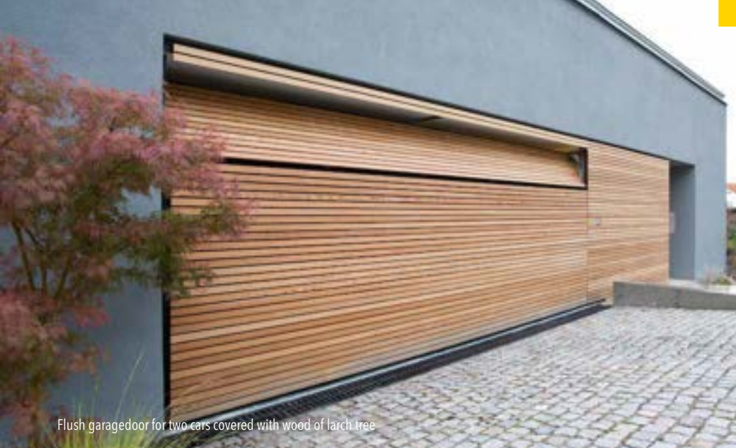
Flush garagedoor for two cars covered with wood of larch tree