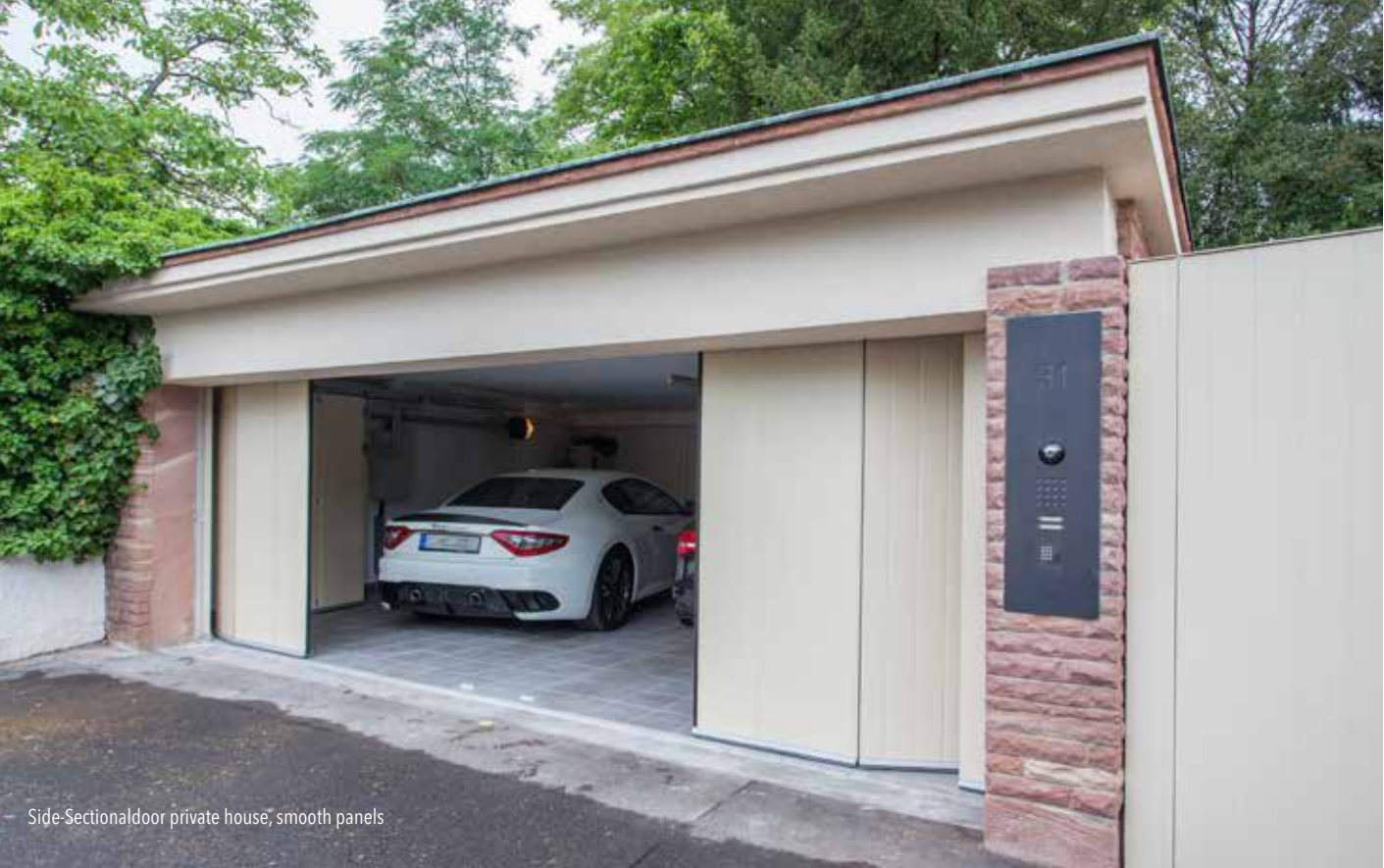
Side-Sectional door private house, smooth panels