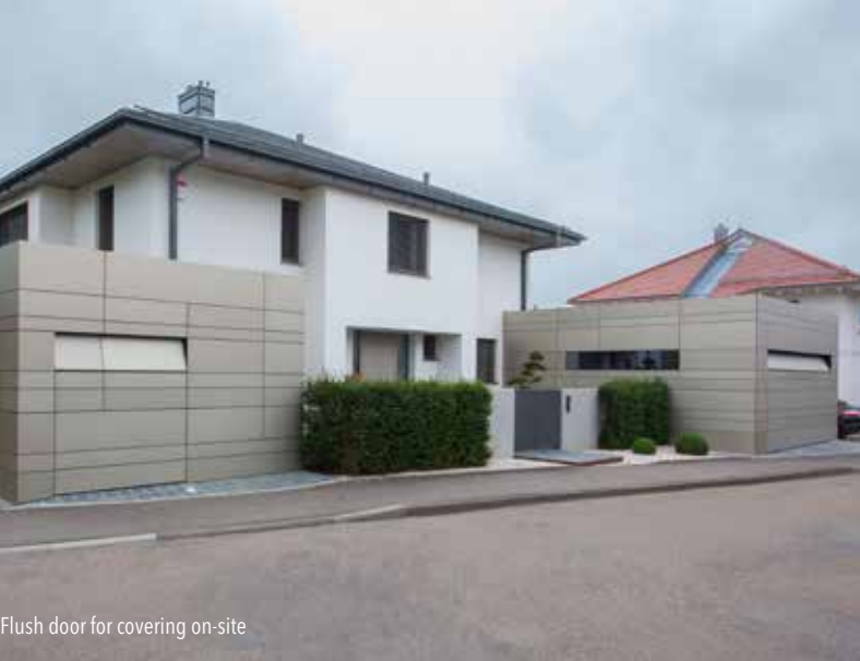
Flush door for covering on-site