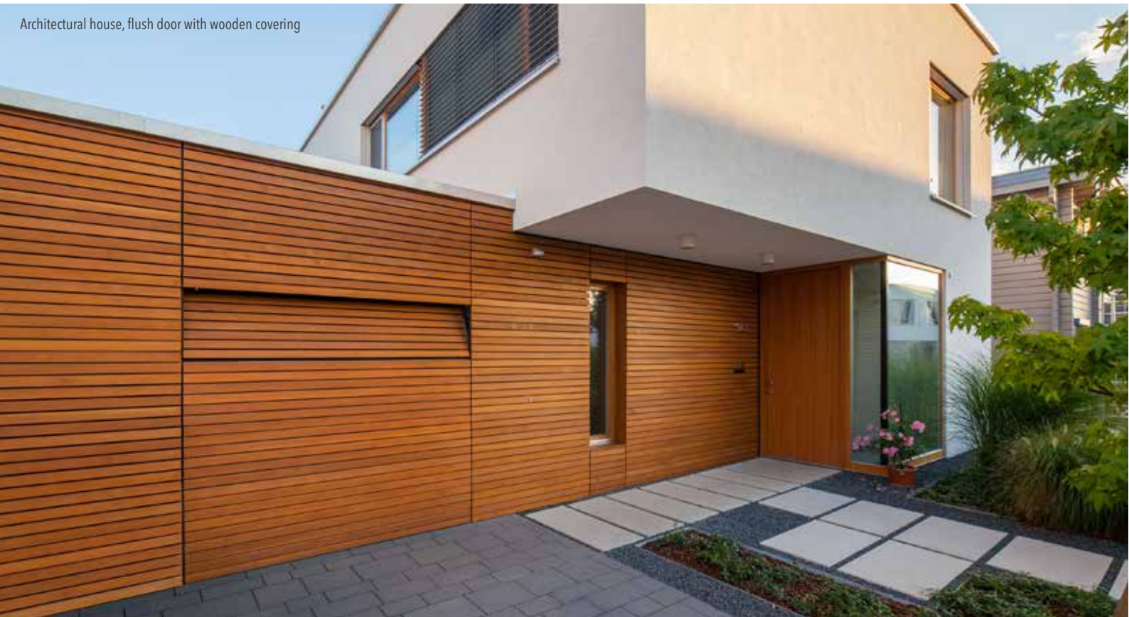
Architectural house, flush door with wooden covering