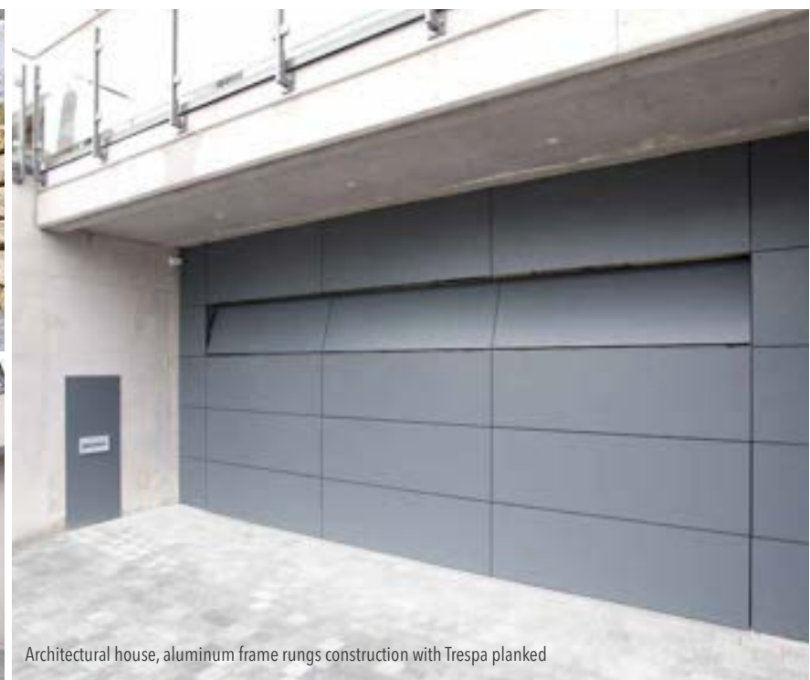
Architectural house, aluminum frame rungs construction with Trespa planked