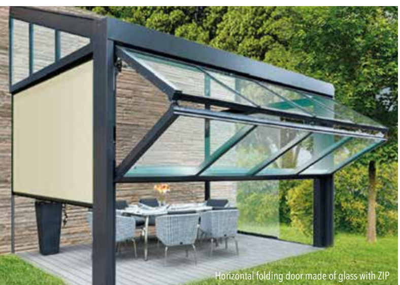
Horizontal folding door made of glass with ZIP