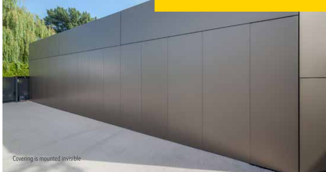
Covering is mounted invisible