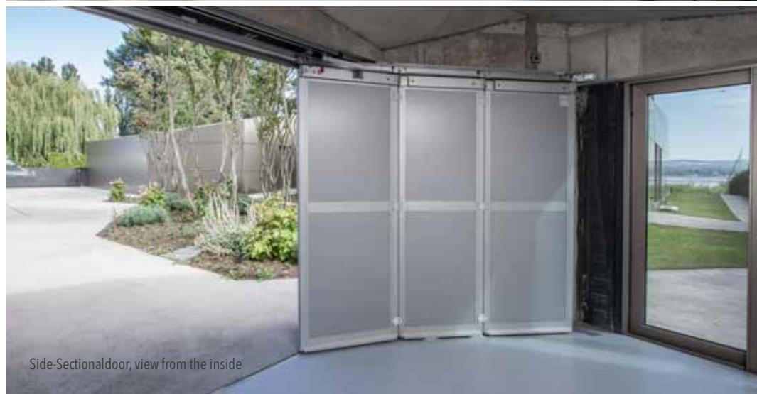
Side-Sectional door, view from the inside