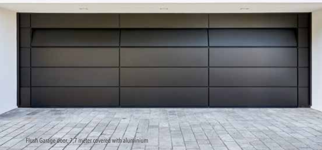
Flush Garage door, 7,7 meter covered with aluminium