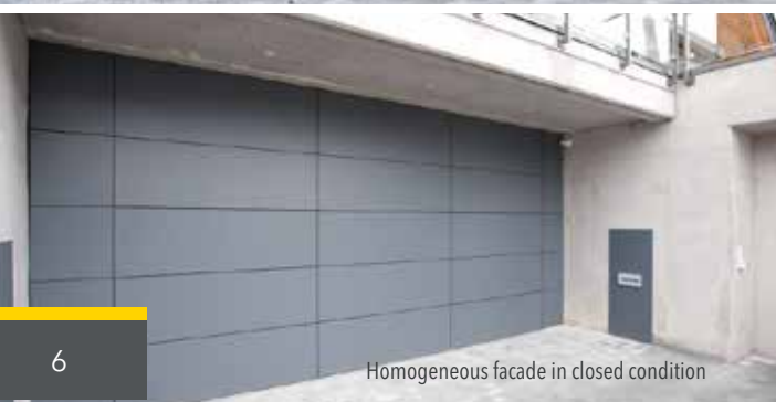
Homogeneous facade in closed condition