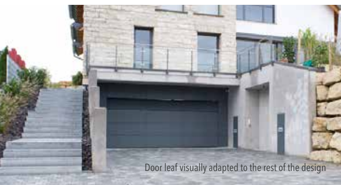
Door leaf visually adapted to the rest of the design

In the project, which is shown below, BeluTec supplied an approx. 5000 x 2200 mm large sectional sectional door. The door consists of an aluminum frame rungs construction with foamed steel sandwich panels. The door leaf is divided into three sections in width and four sections in height. It was prepared for the inclusion of an on-site planking of 10 mm Trespa and 20 mm lathing. The top section of the flush sectional sectional door was designed as a tilting wing for ventilation.