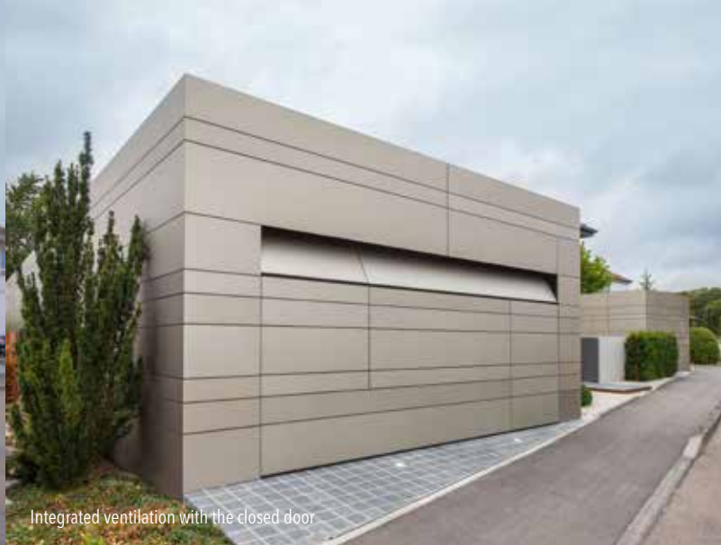
Integrated ventilation with the closed door